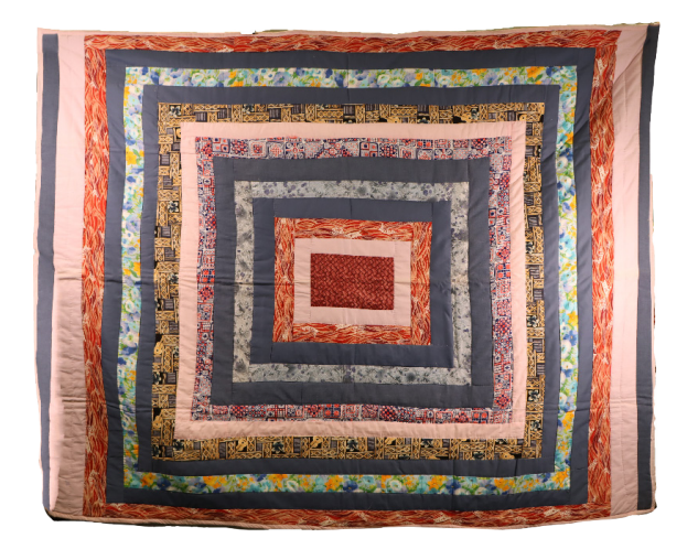
Title: Housetop Date: Janurary 14, 2022 Dimensions: 69" x 88" Artist: Arlonzia Pettway

Title: Flying Geese Date: June 26, 2022 Dimensions: 79" x 80" Artist: Belinda Pettway