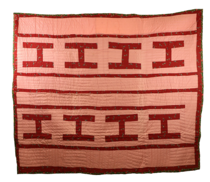
Title: "H" Block Quilt Dimensions: 73" x 89" Artist: Arlonzia Pettway