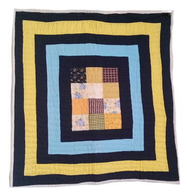
Title: Pigs in the Pen (#2) Dimensions: 44" x 45" Artist: Lucy Lee Pettway-Witherspoon