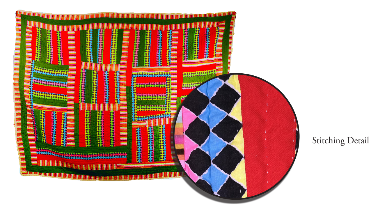
Title: Bars Block Dimensions: 70" x 92" Artist: Monique Pettway-Castle Berry

Title: The Cross Date: None Dimensions: 74" x 76" Artist: Belinda Pettway