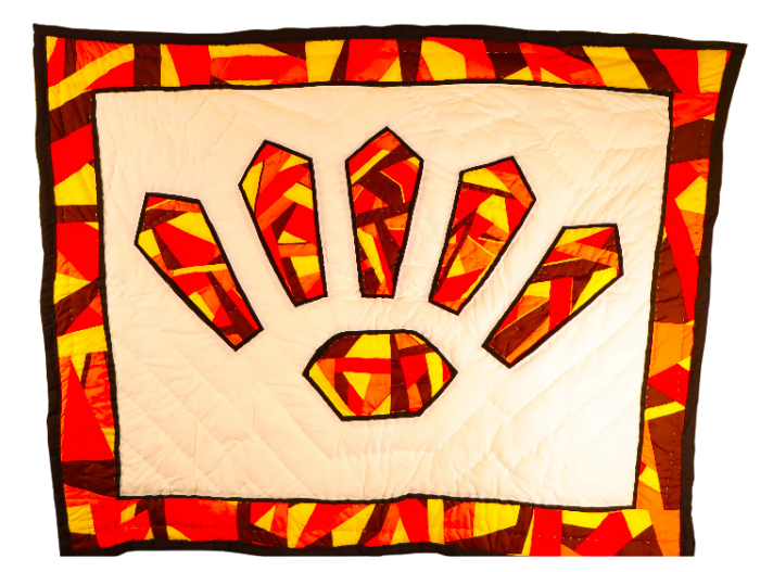
Title: Giving Thanks Date: September 9, 2022 Dimensions: 45" x 58" Artist: Deshuan Smith