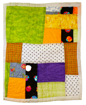
Title: Deep Blue Sea Date: May 7, 2022 Dimensions: 30" x 29" Artist: Deshuan Smith

Title: Untitled Date: March 11, 2020 Dimensions: 20" x 26" Artist: Mary L Pettway