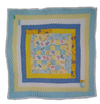
Title: Pigs in the Pen (#1) Dimensions: 37" x 39" Artist: Rita Mae Pettway