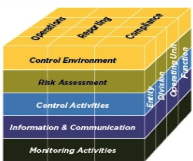
COSO Internal Control Framework

To help ensure full compliance with grant regulatory requirements, and District requirements for financial and operational feasibility. This Compliance Assurance Program (CAP) is scalable in terms of frequency and scope of each CAP technique required to obtain adequate compliance status. The CAP program utilizes compliance best practices and COSO internal control best practices concepts, as indicated below, as well other techniques, such as engaging additional stakeholders into the compliance and compliance monitoring process.