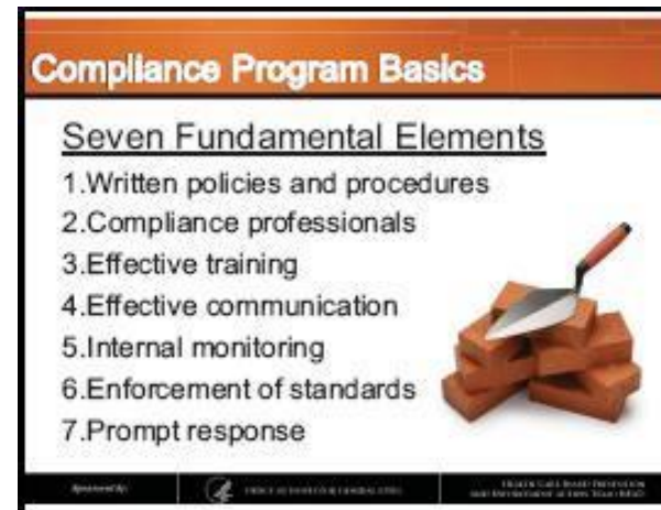
Compliance Assurance Program