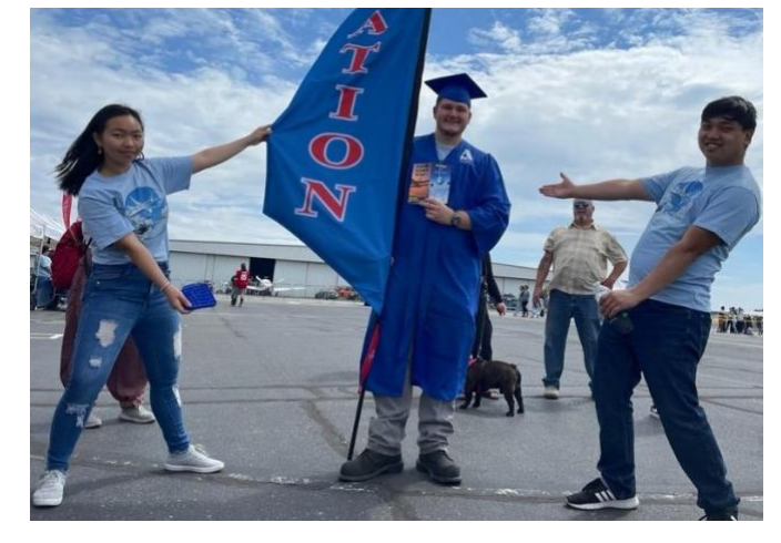
CoA AMT students walking in the event promoting the AMT AA /AS Degree Program.

Following a three-year hiatus due to the pandemic, the Hayward Airport's open house drew a crowd of about 2,000 participants this year.