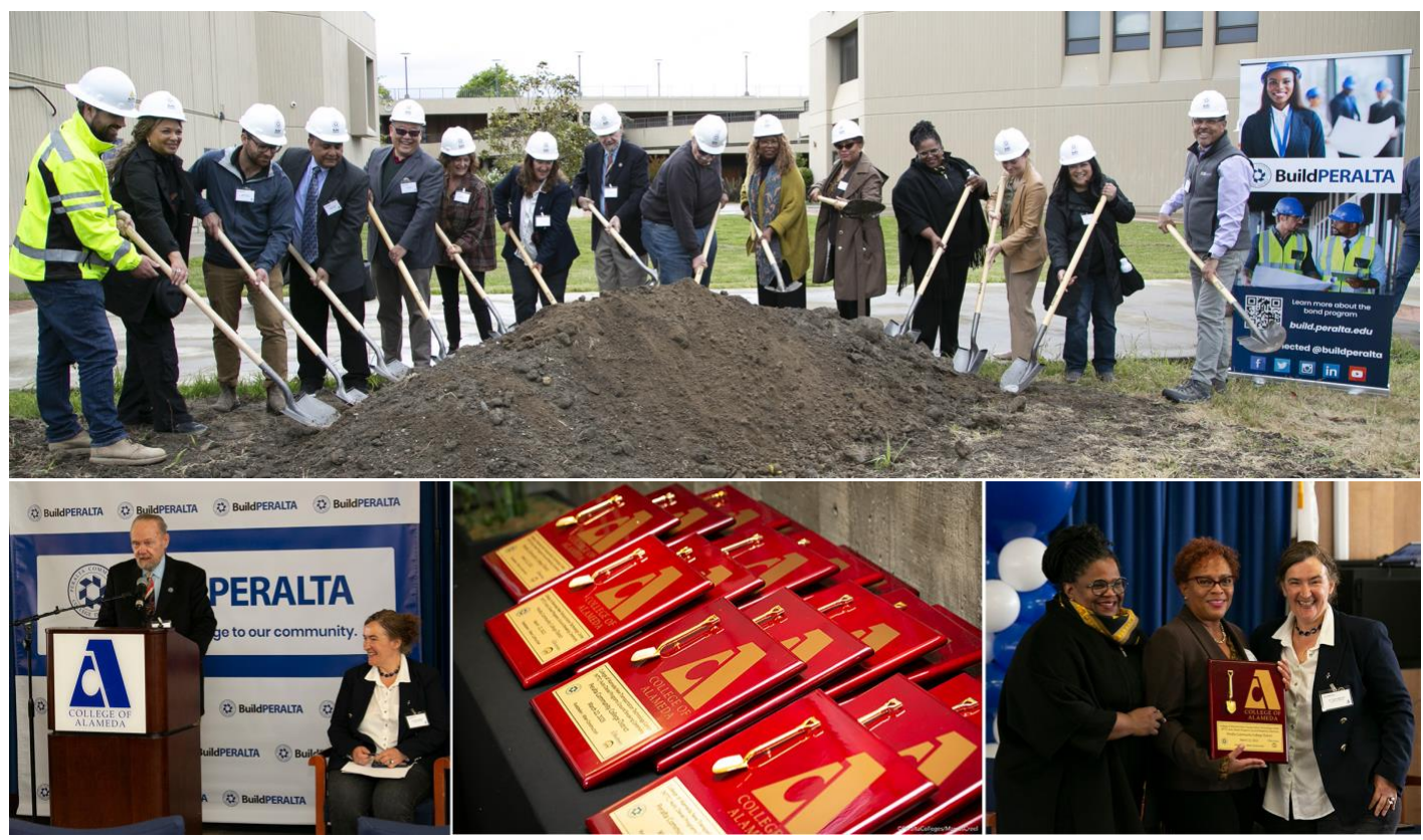
College and District representatives broke ground for CoA's New Transportation Technology Center (NTTC) for Auto Diesel Programs, on Wednesday, May 3, 2023.