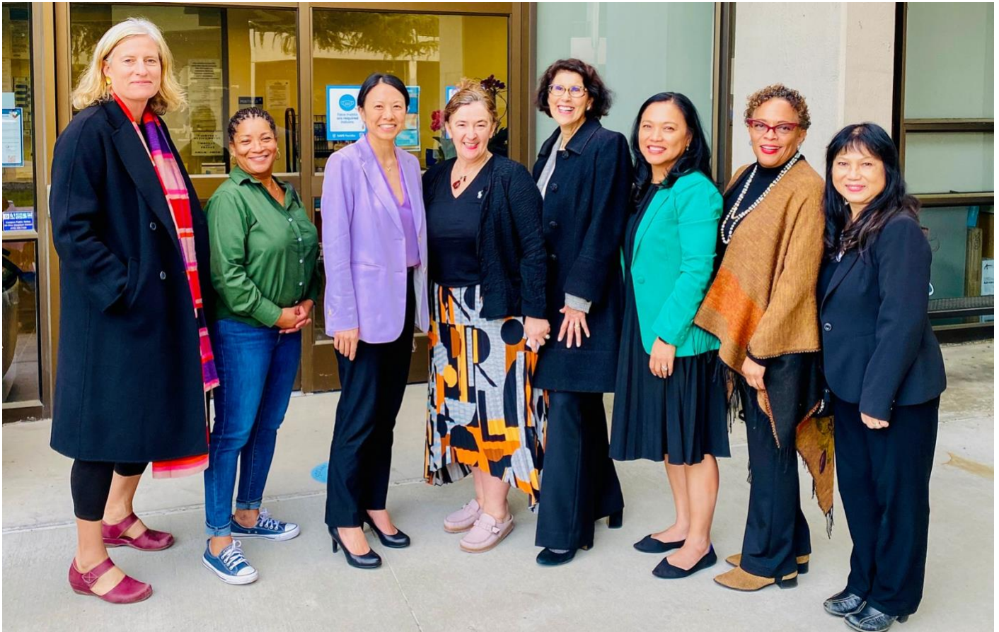
Leadership Unites: Stakeholders from Alameda City, Asian Health Services, and College of Alameda come together to discuss and strengthen their partnership for a healthier and brighter future.