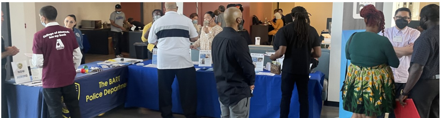
Photo: Guests in line to speak with BART and BART Police recruiters

The College of Alameda Career and Employment Center hosted the September Safari Job Fair event on September 7, 2022. The on-campus, open to the public, job fair took place in the spacious lobby of the College’s new Liberal Arts building (Building H). CoA hosted 26 employers including: Alameda County Human Resource Services, Alameda Unified School District, BART, Caltrans, EBMUD, Peralta Community College District Human Resources, and Waste Management among others. Participants enjoyed free coffee and pastries donated by Peets' Coffee & Tea and Semifreddis (both employers also tabled for the event). The two-hour job fair provided 140 job seekers with access to recruiters and hiring managers. Career and Employment Center staff members also promoted enrollment in fall semester classes and College’s Fall 500 on Us campaign.