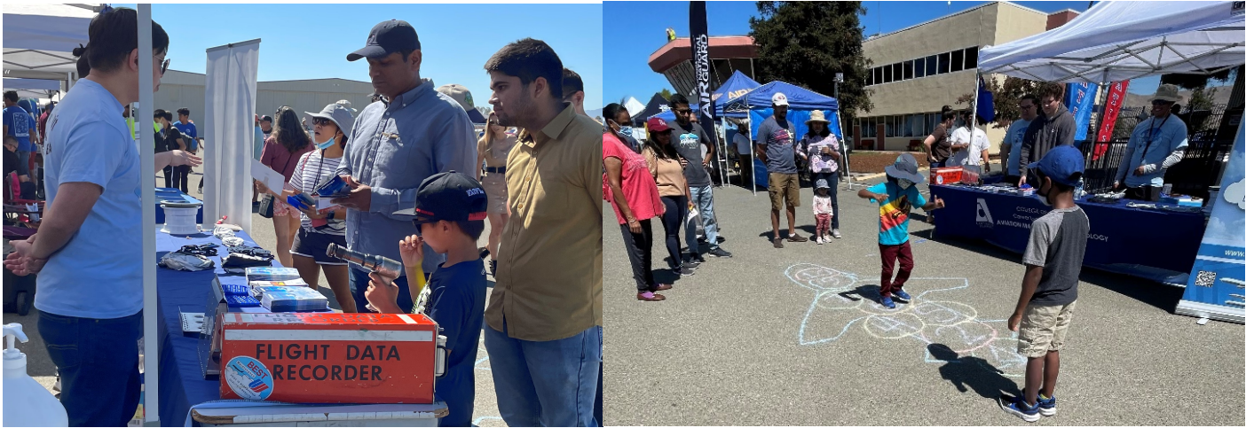
Photos from Left: While adults explored AMT Program options tykes enjoyed a game of hop scotch at the Reid-Hillview Airport Aviation Career