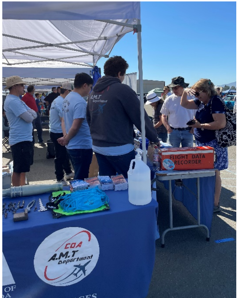
Avid CoA AMT student volunteers staff the College's booth at the Reid Hillview Airport event on Saturday, September 3, 2022.