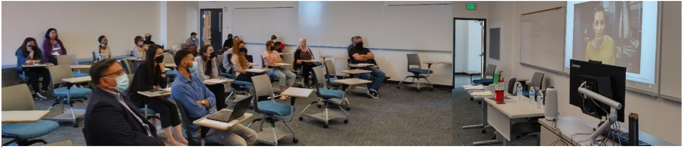
Photo: Active Shooter training was held at CoA in HyFlex format including both online and in-person participants.