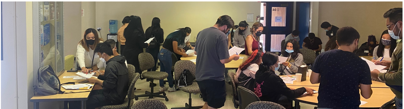
Photo: A total of 42 students attended ACCESO's first in-person orientation.